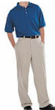
Appropriate Attire: Collared Shirt & Slacks