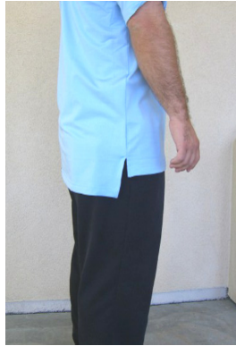
Inappropriate Attire: Shirts with a slit, must be tucked in