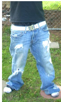
Inappropriate Attire: Torn, Soiled, and Sagging Jeans