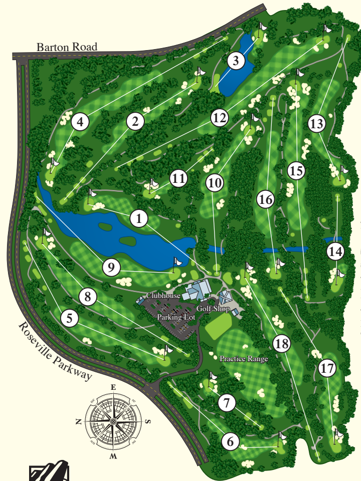
Original painting by Jim Fitzpatrick